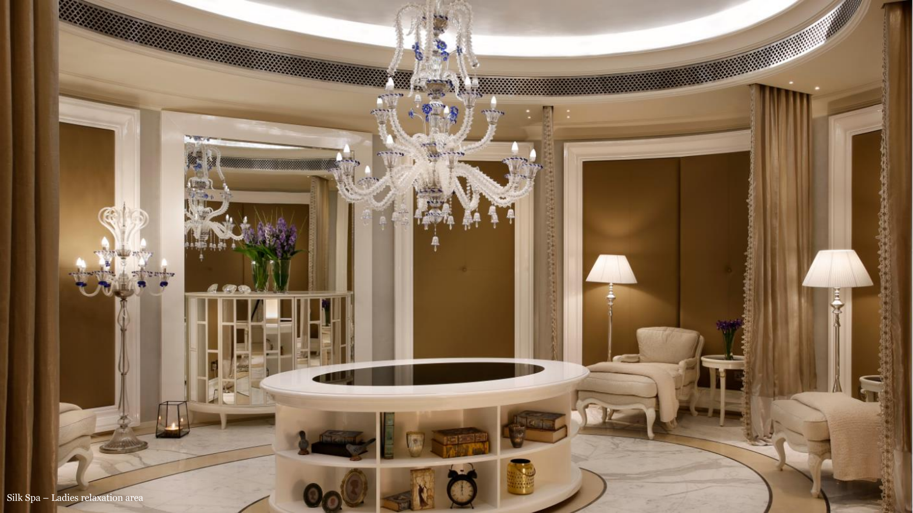
Silk Spa – Ladies relaxation area