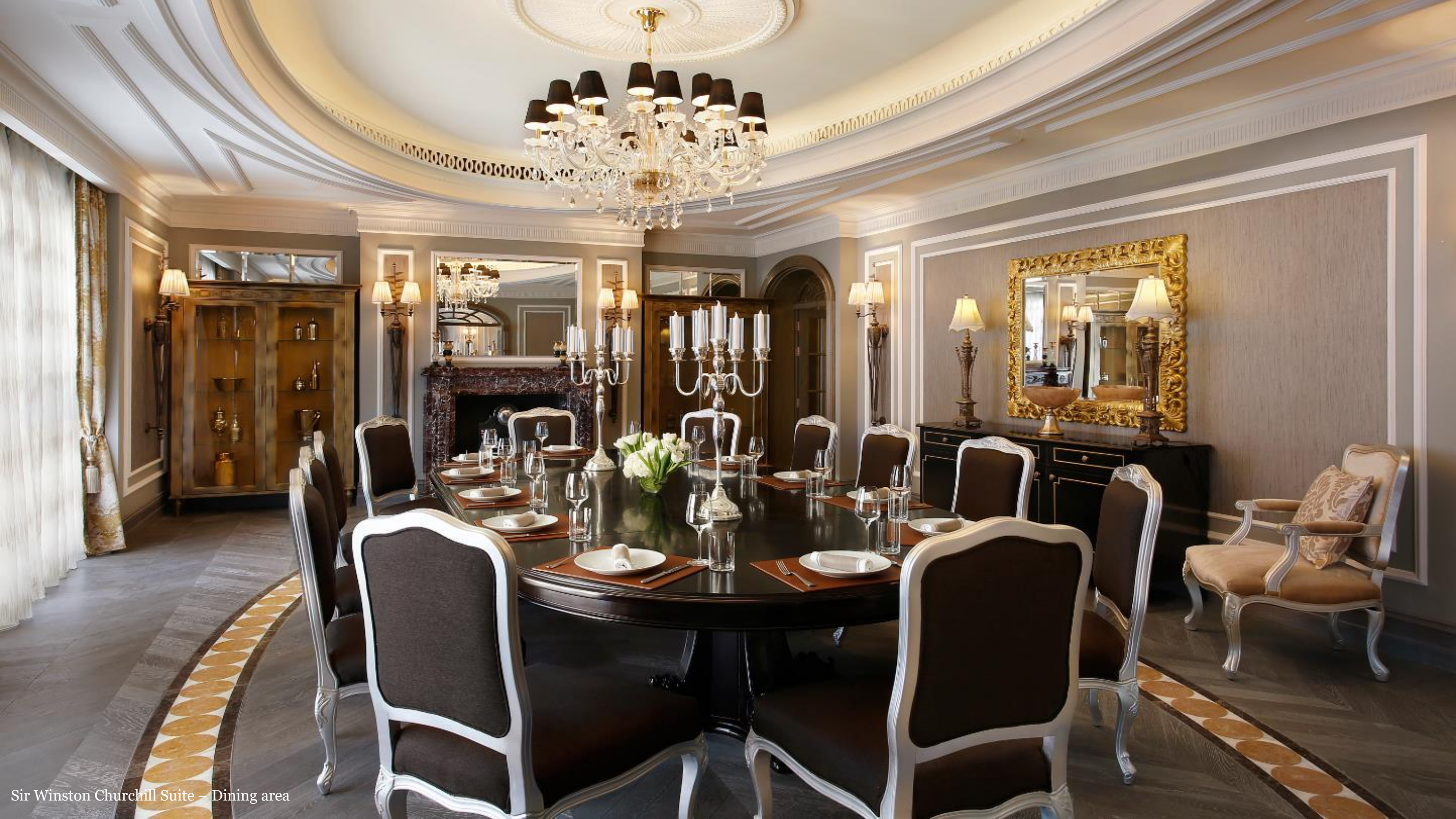
Sir Winston Churchill Suite – Dining area