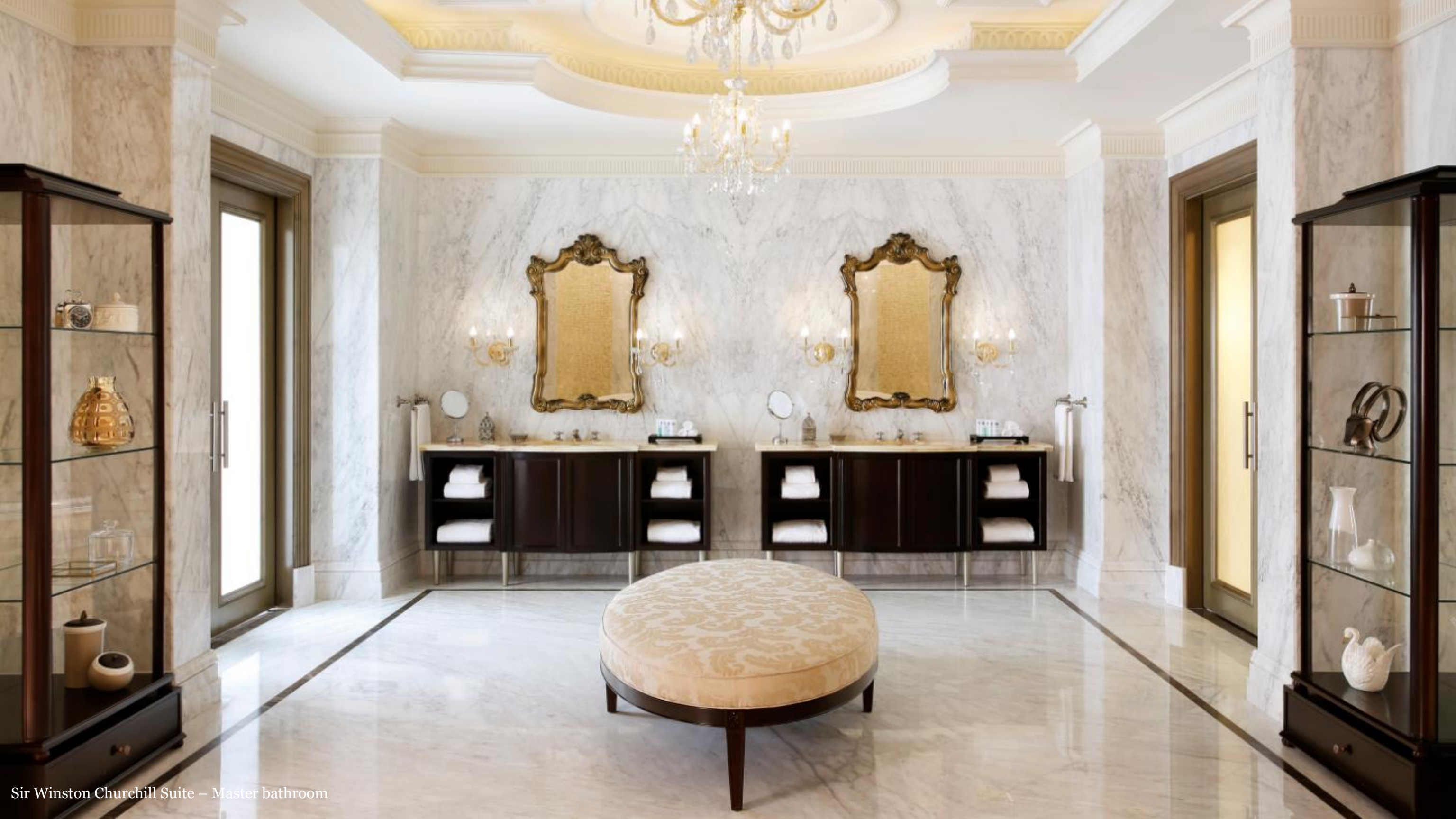
Sir Winston Churchill Suite – Master bathroom