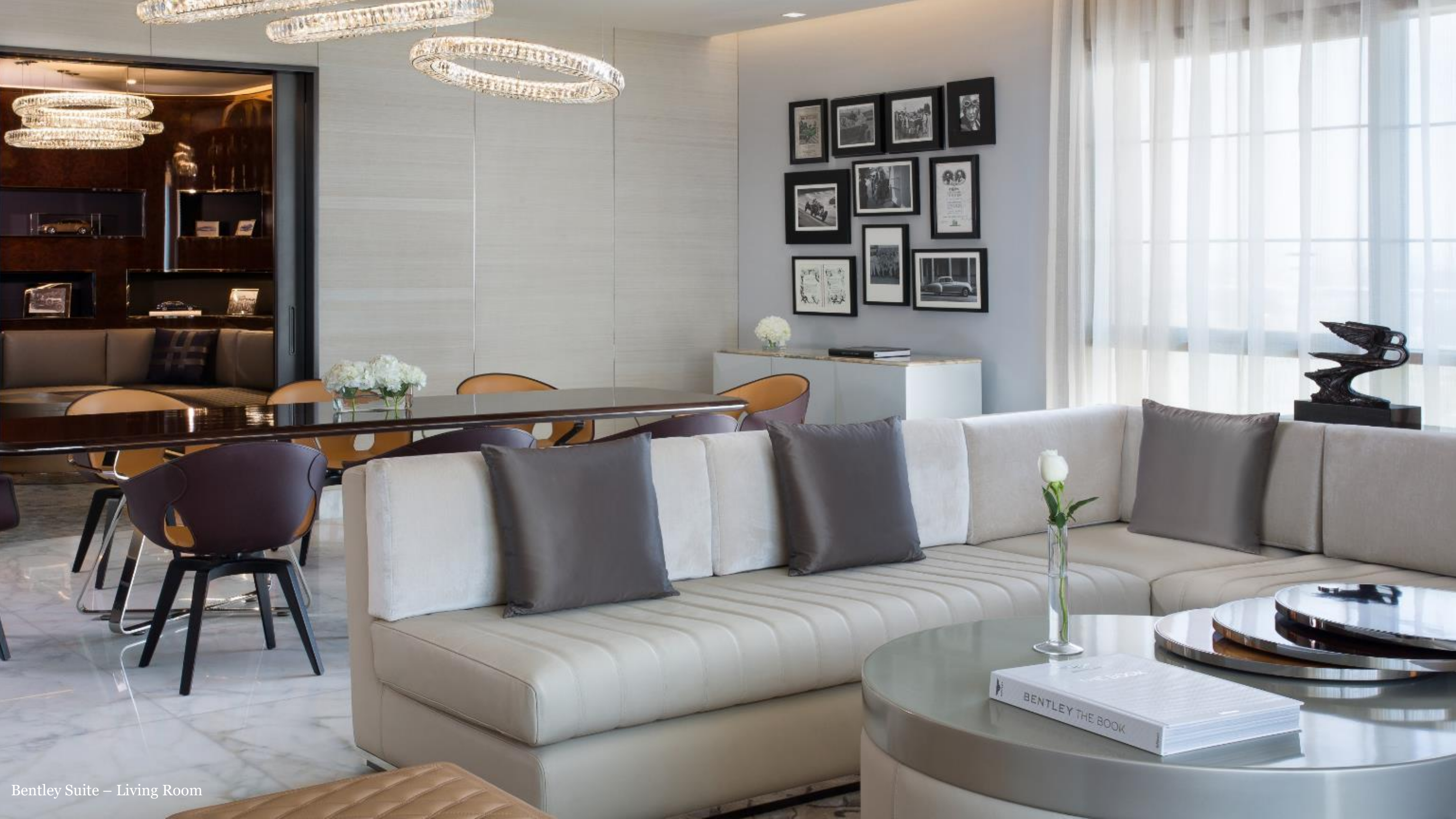
Bentley Suite – Living Room