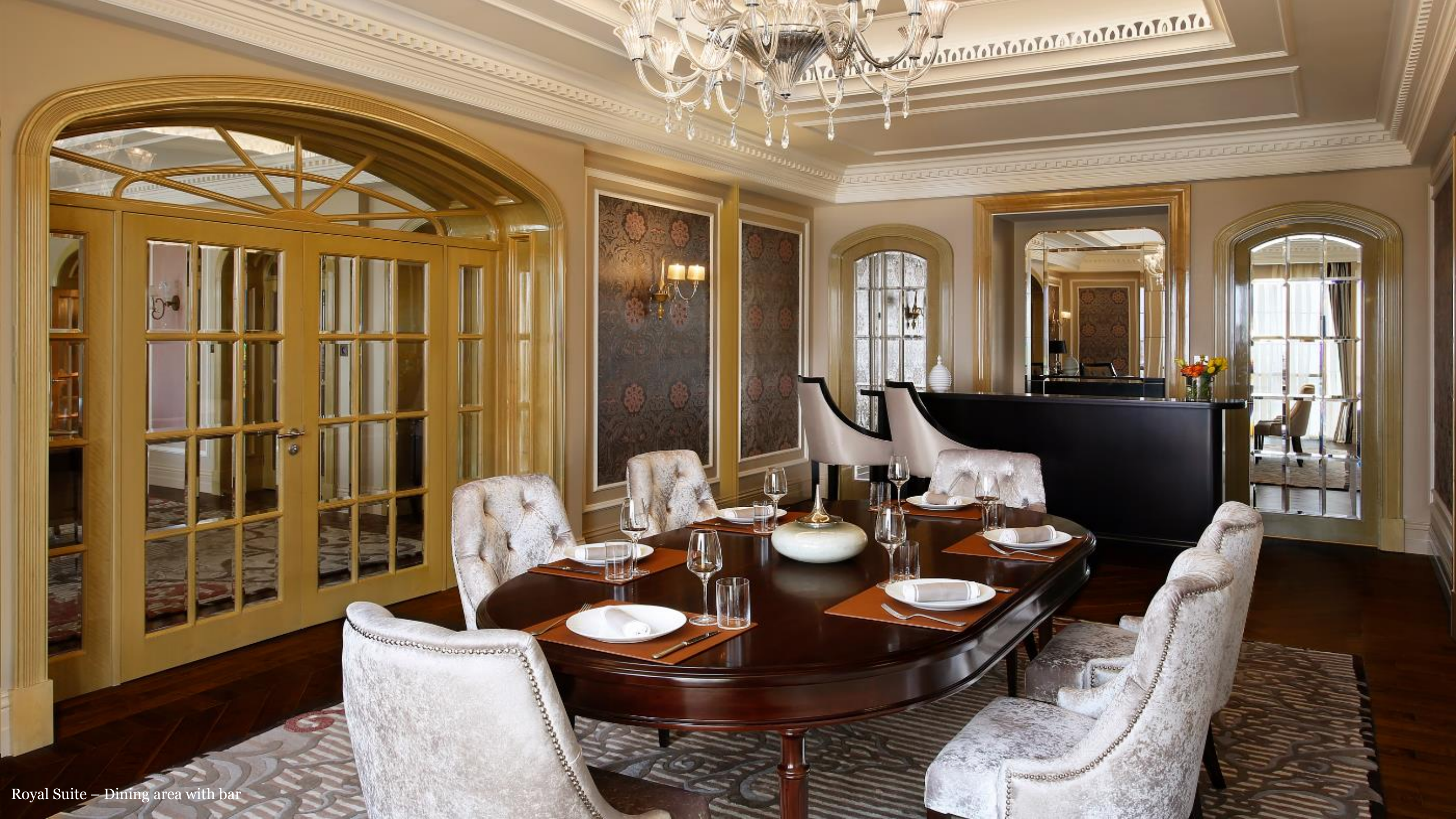
Royal Suite – Dining area with bar