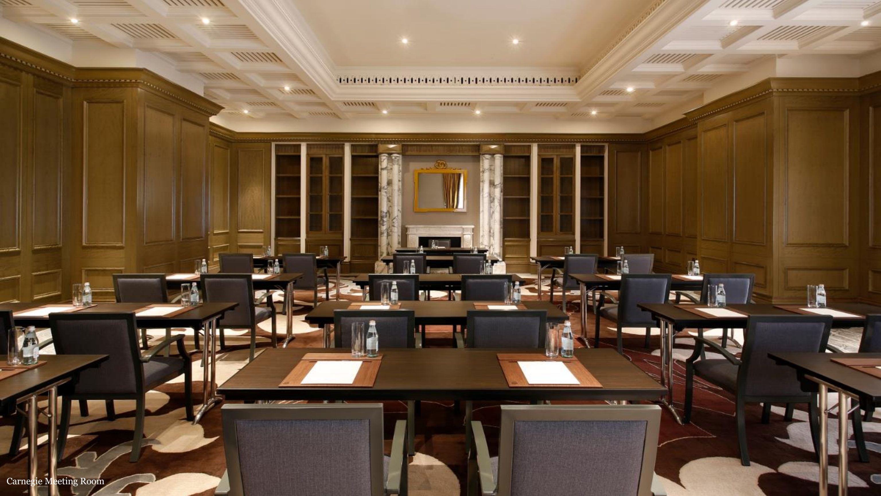
Carnegie Meeting Room