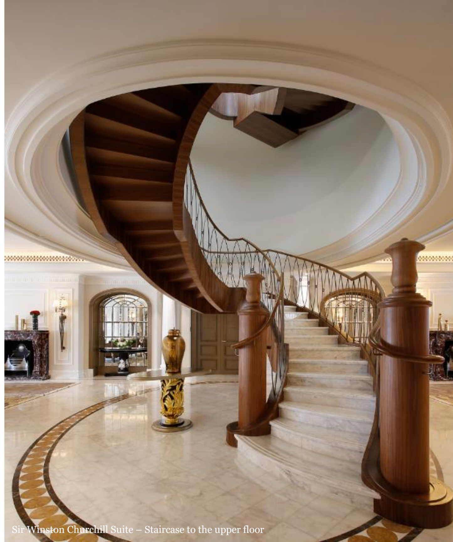
Sir Winston Churchill Suite – Staircase to the upper floor