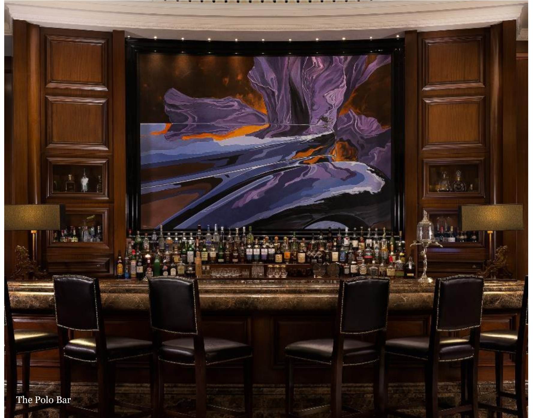
The Polo Bar