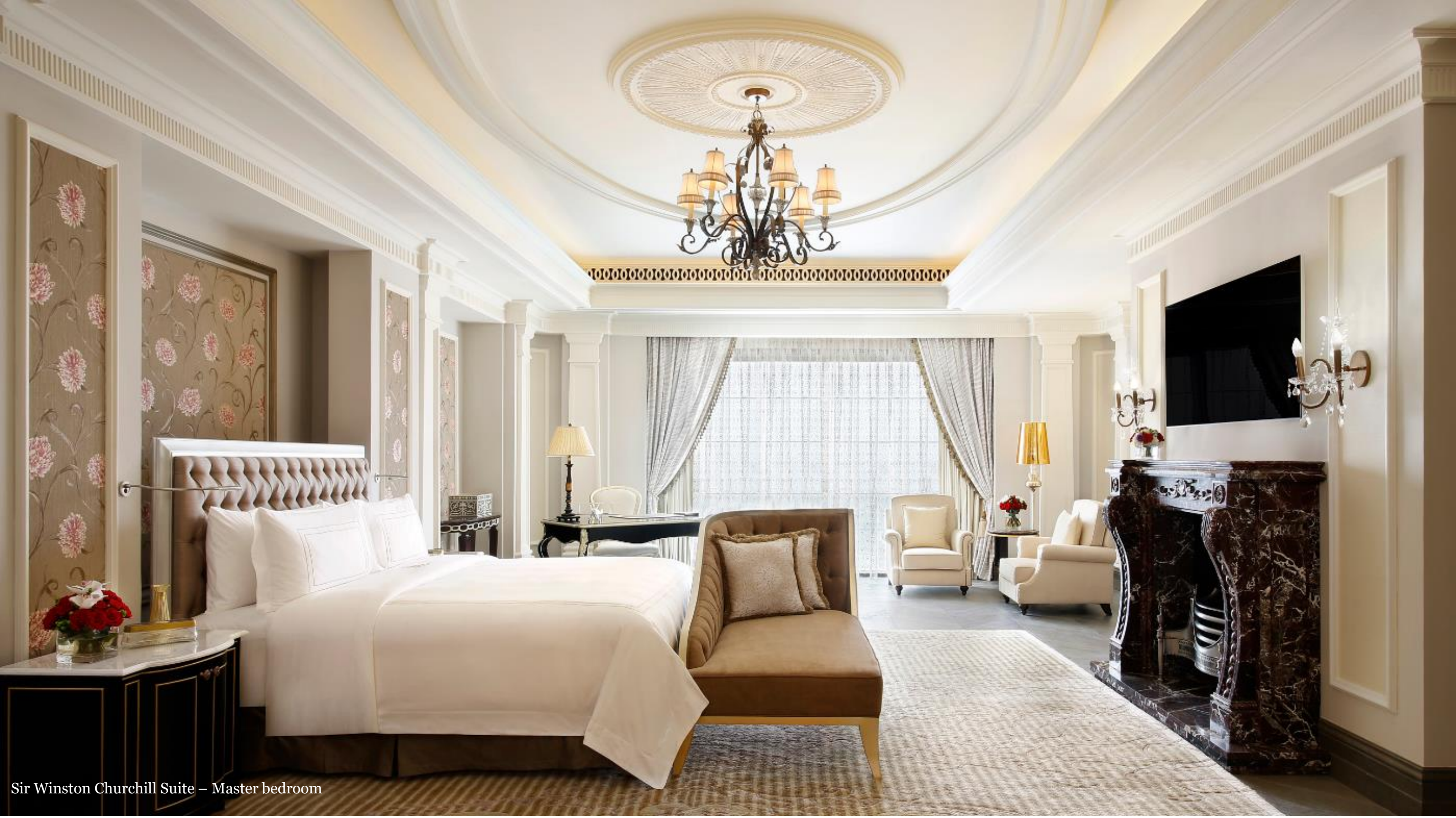
Sir Winston Churchill Suite – Master bedroom