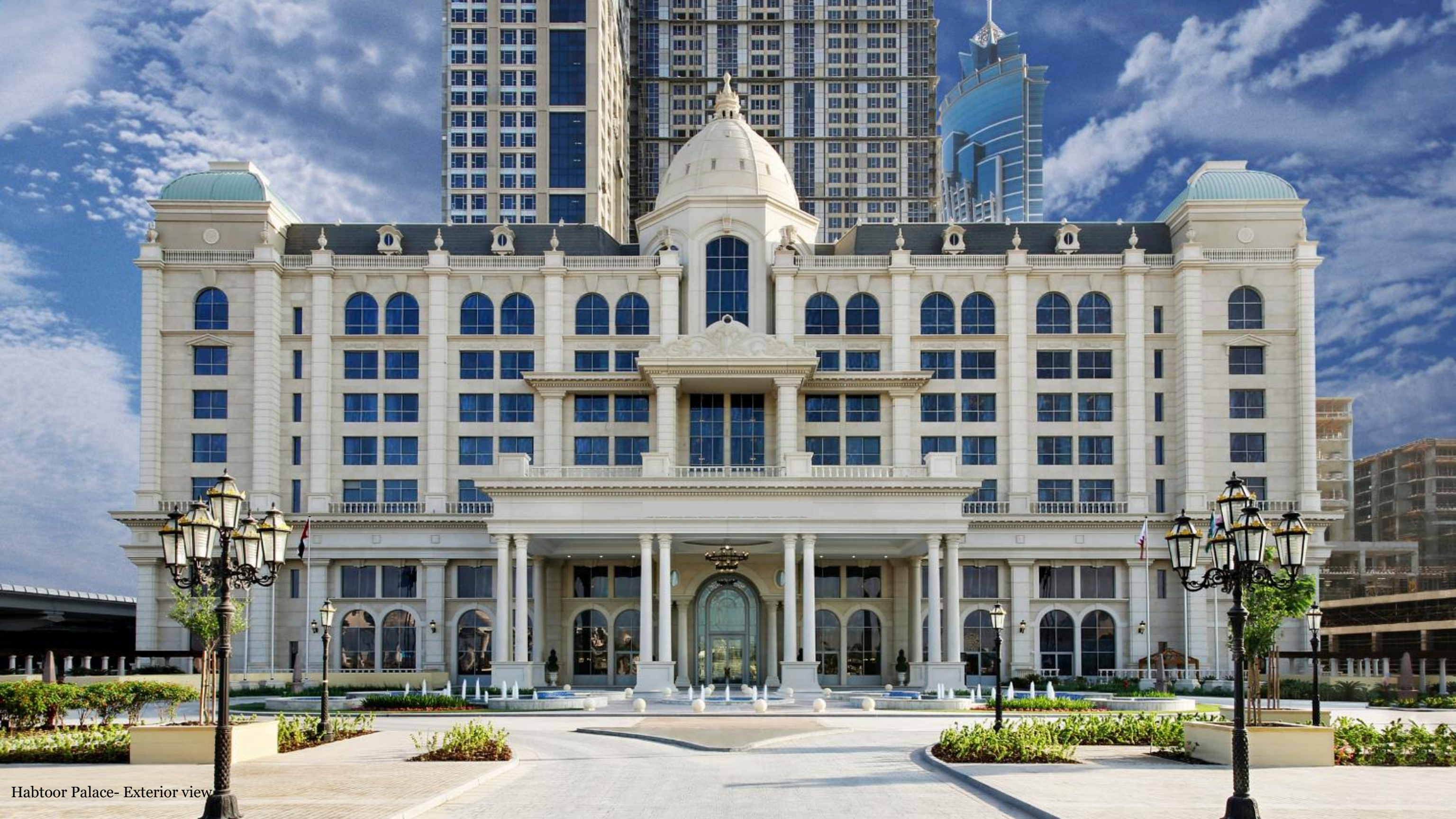
Habtoor Palace- Exterior view