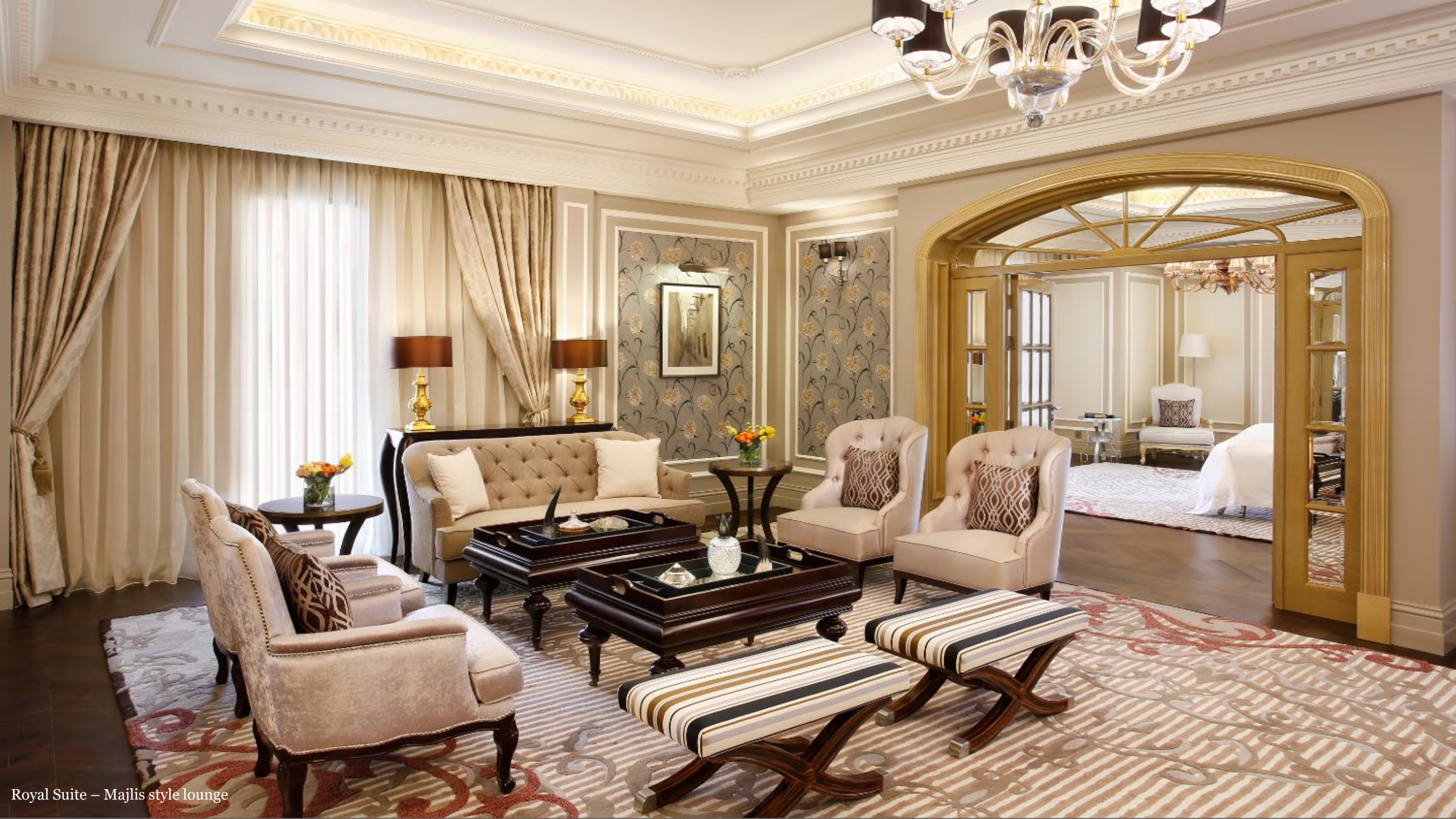
Royal Suite – Majlis style lounge