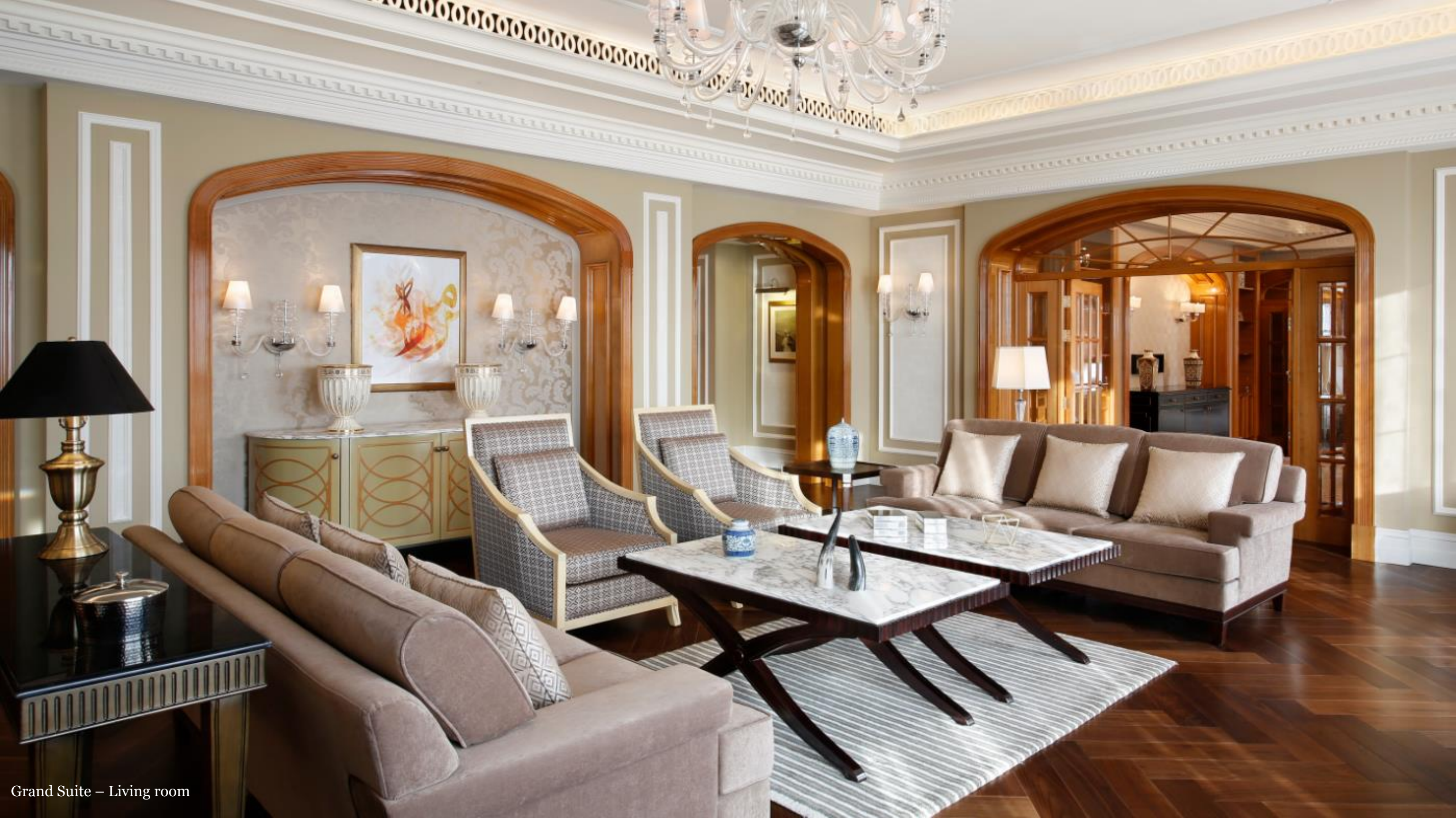
Grand Suite – Living room