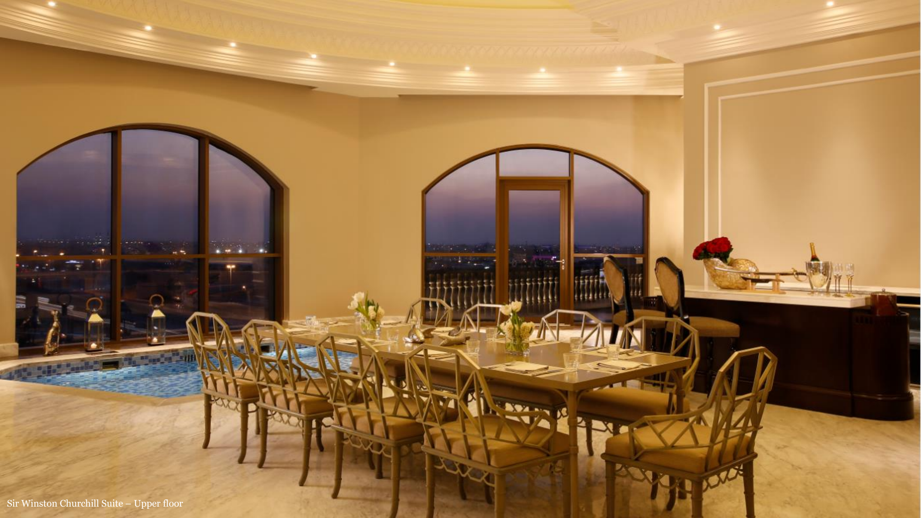
Sir Winston Churchill Suite – Upper floor