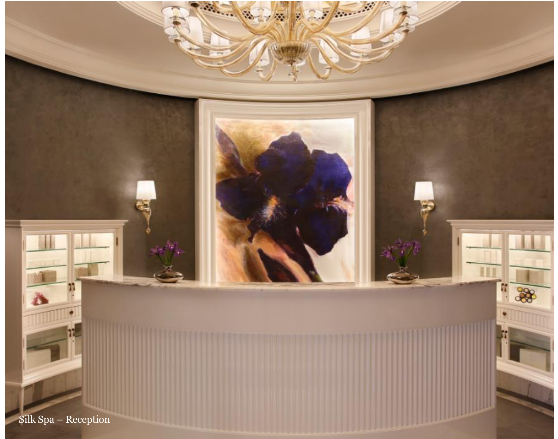
Silk Spa – Reception