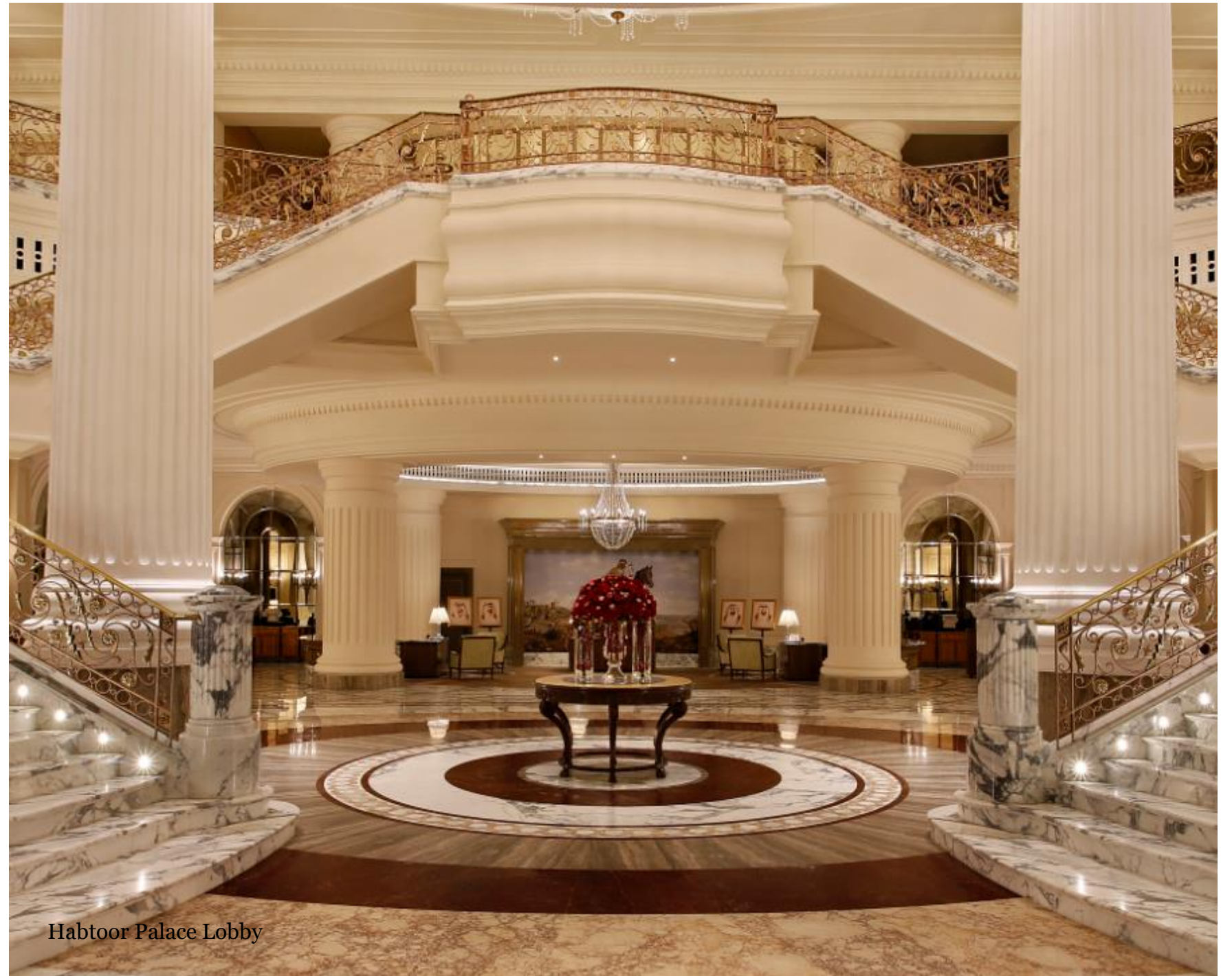
Habtoor Palace Lobby