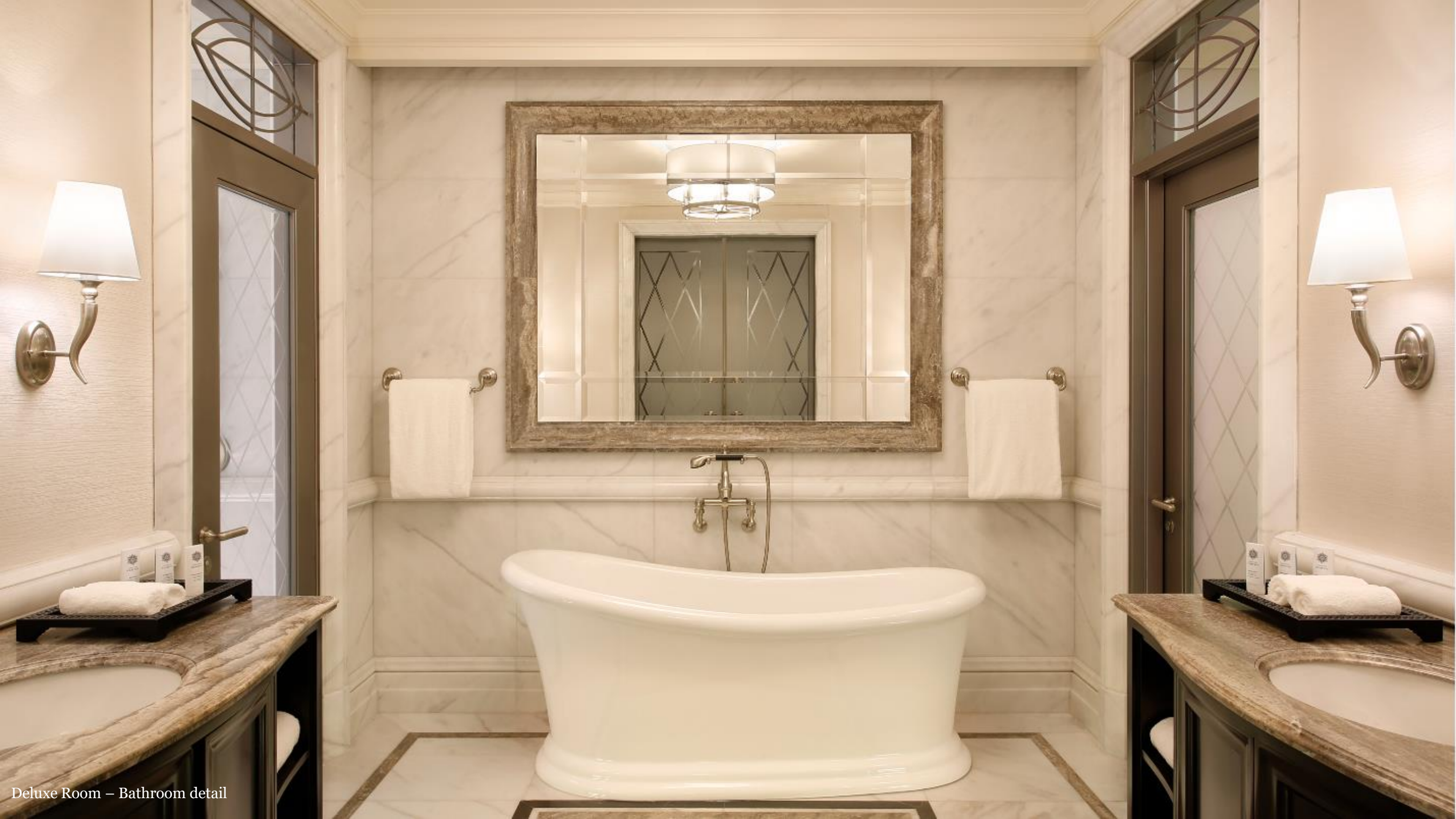
Deluxe Room – Bathroom detail