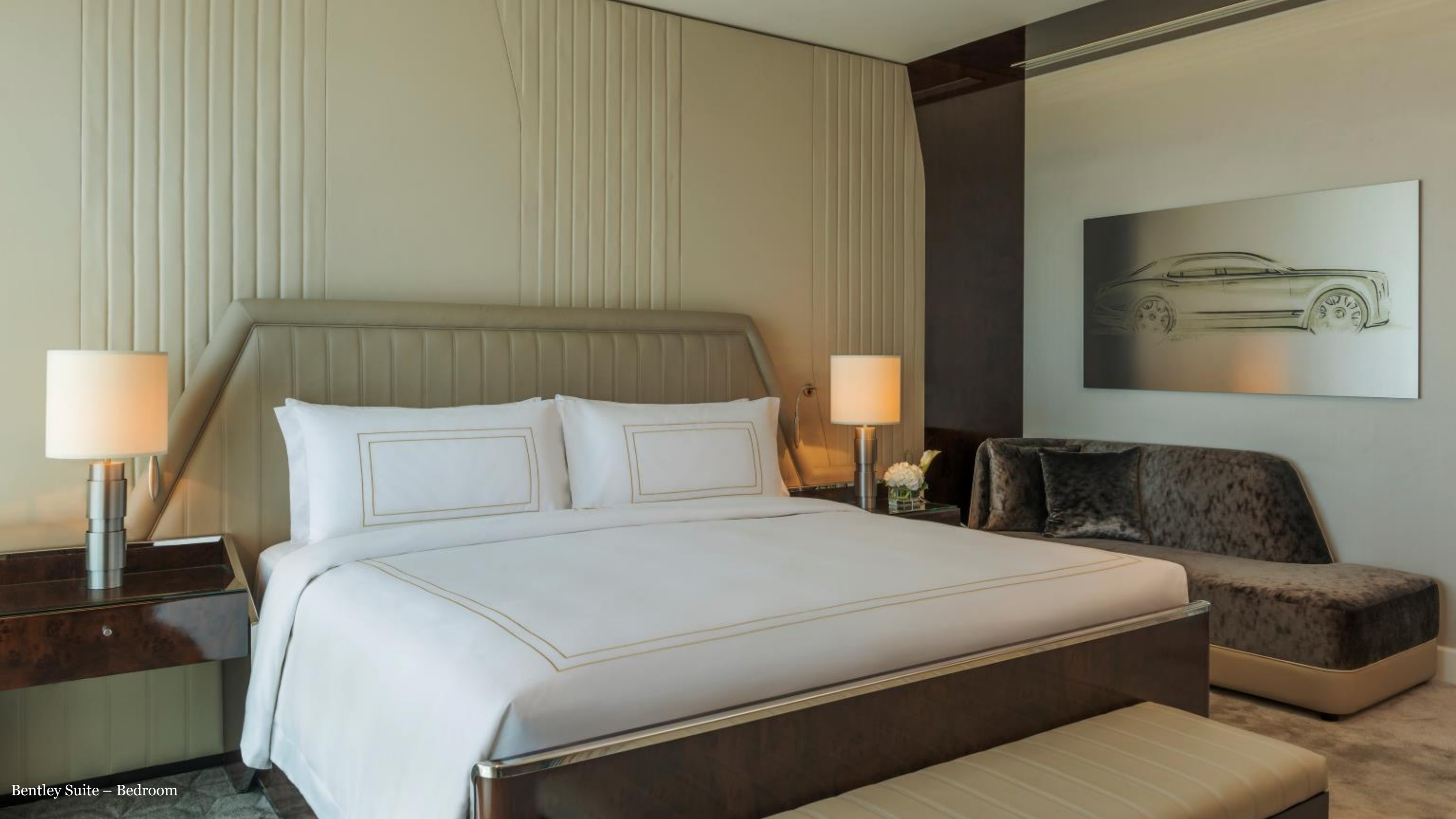
Bentley Suite – Bedroom