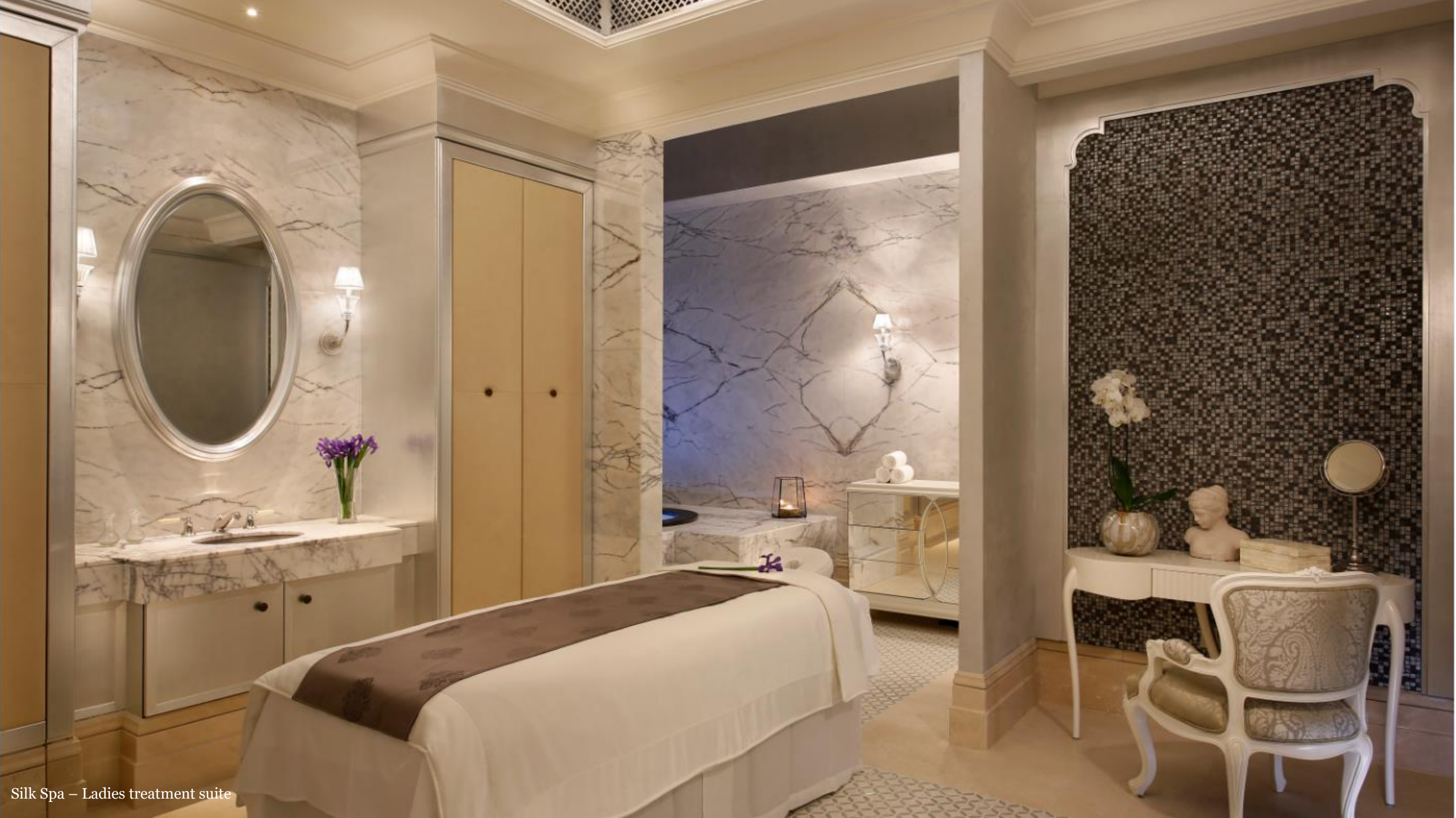
Silk Spa – Ladies treatment suite