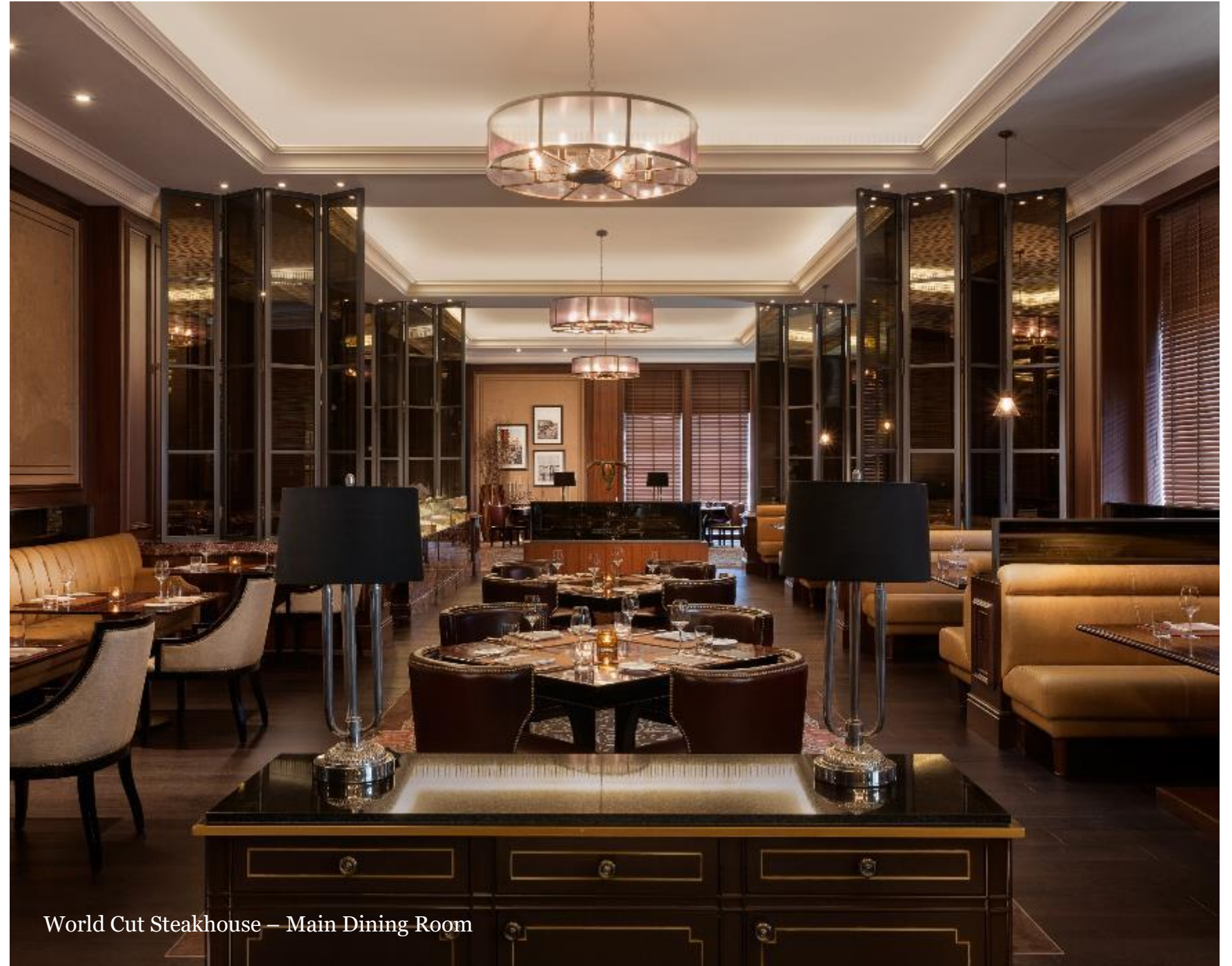
World Cut Steakhouse – Main Dining Room