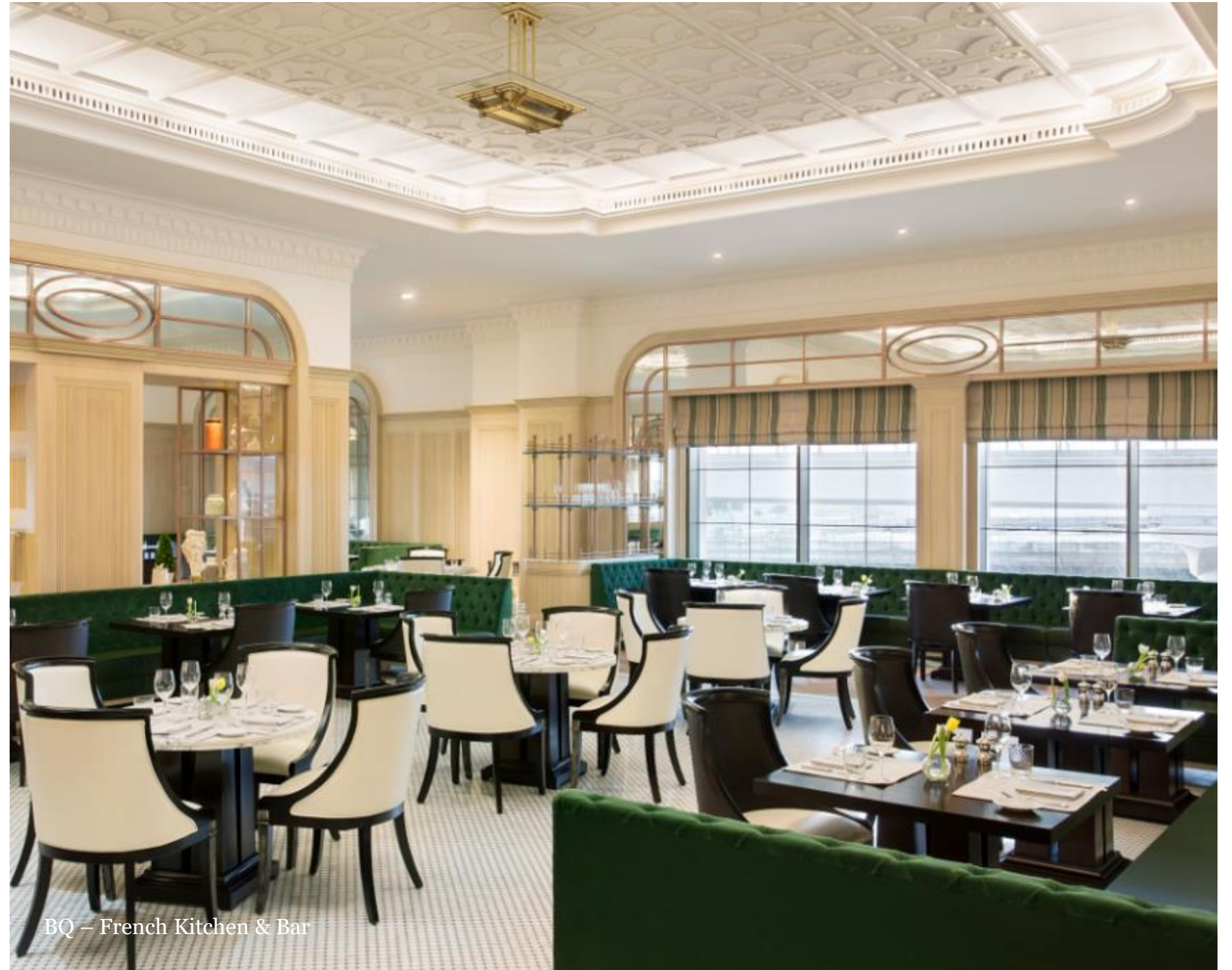
BQ – French Kitchen & Bar