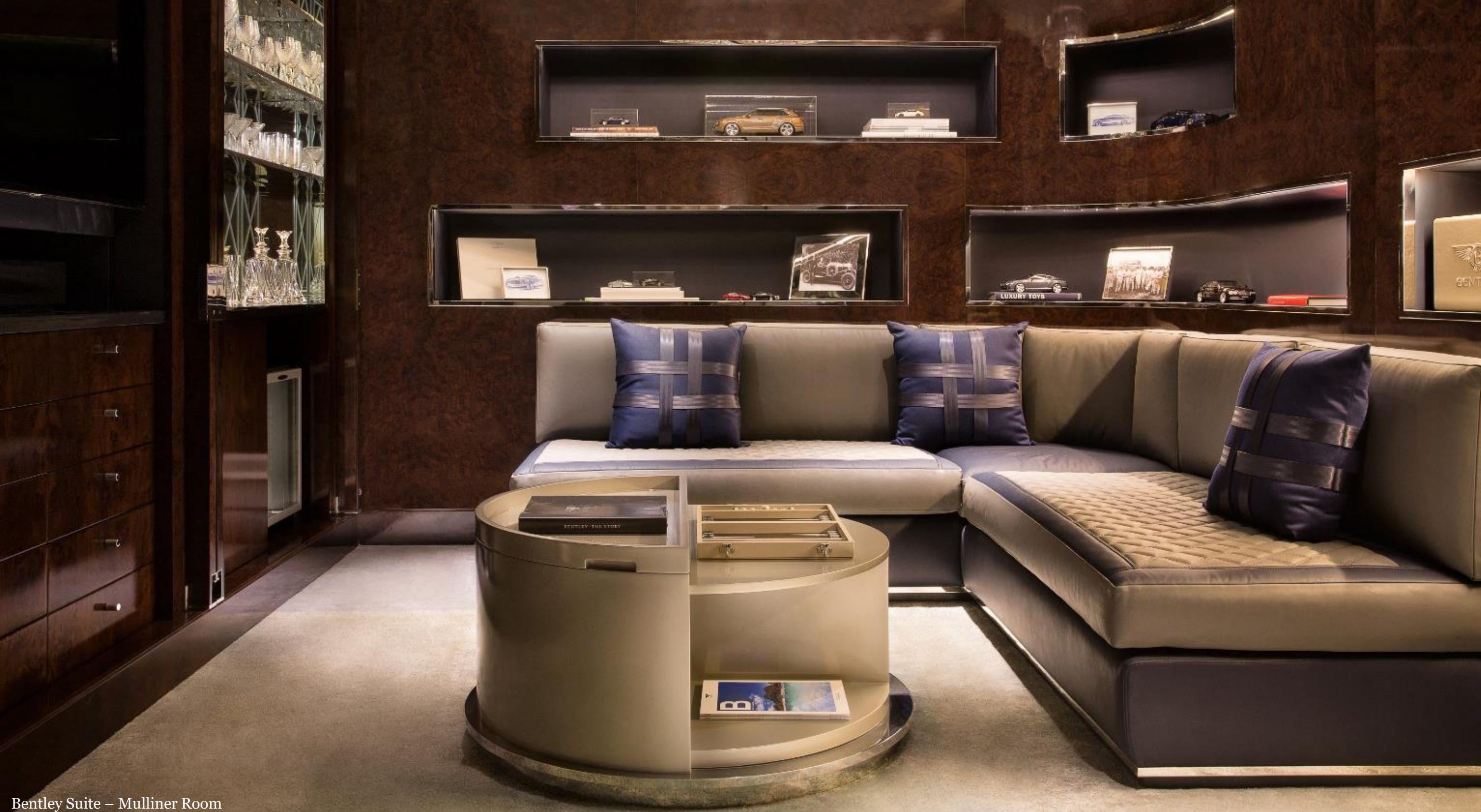
Bentley Suite – Mulliner Room