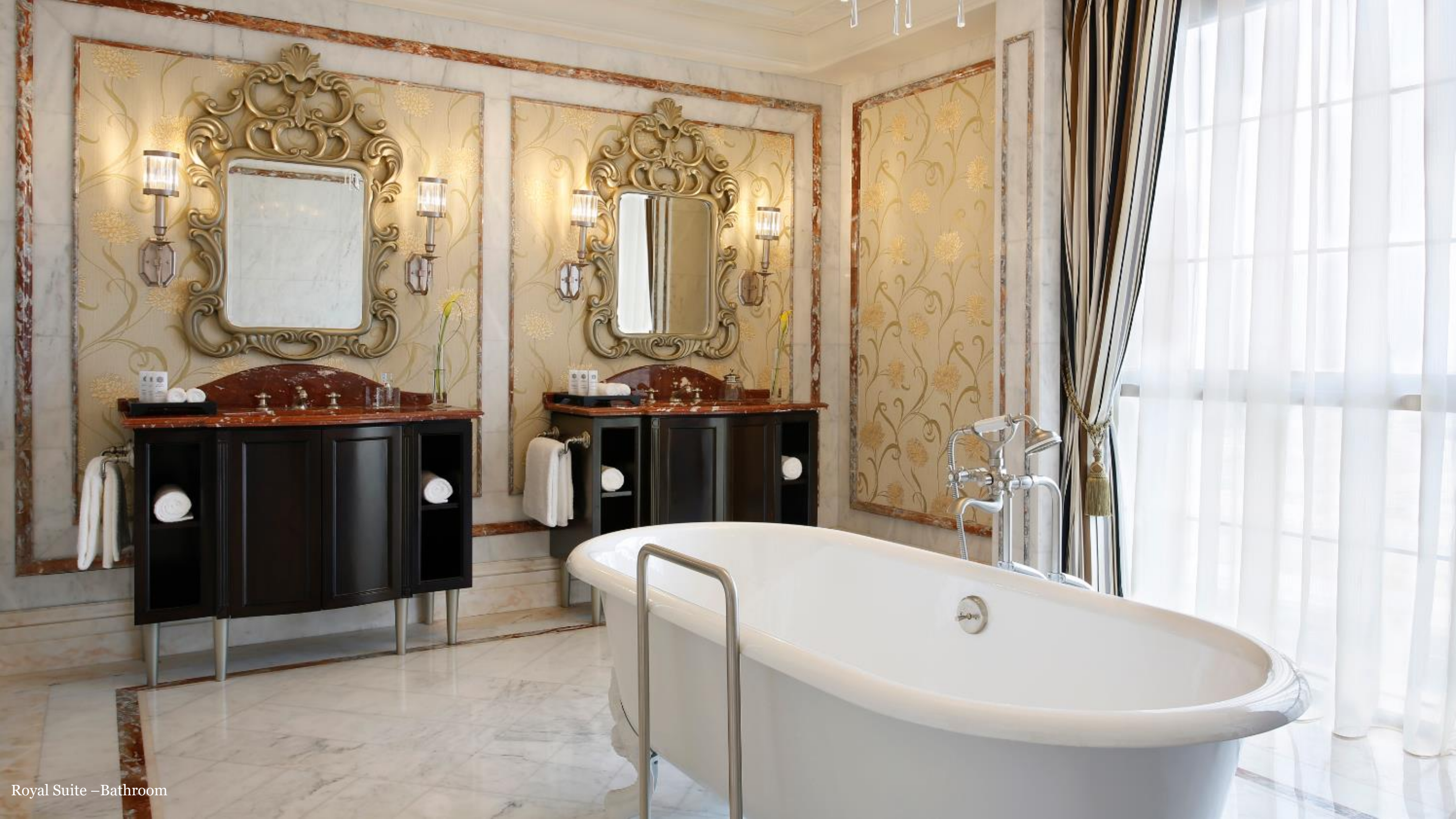
Royal Suite – Bathroom