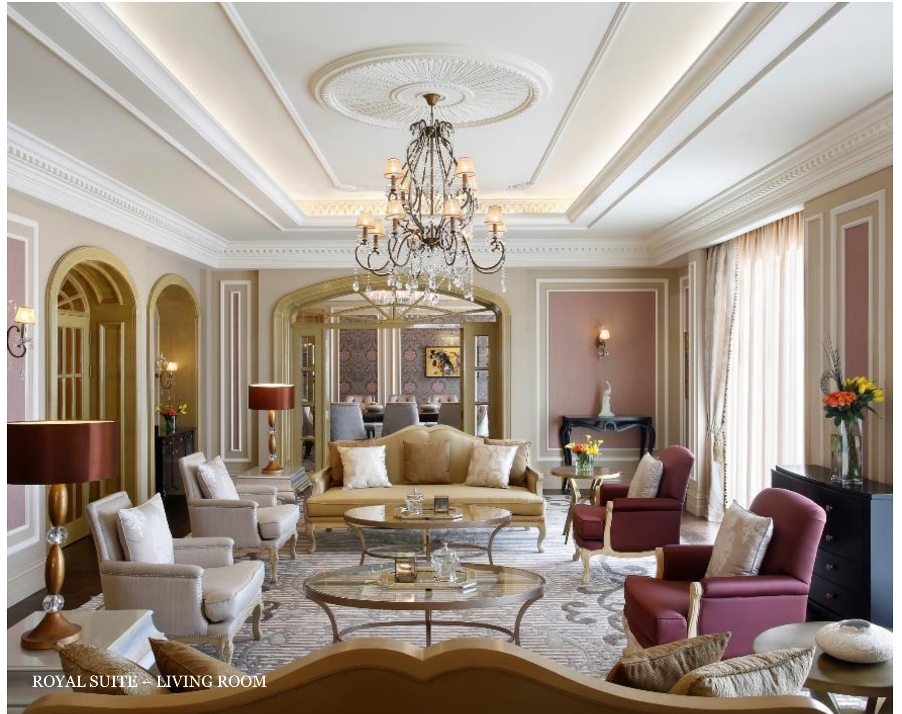
ROYAL SUITE - LIVING ROOM