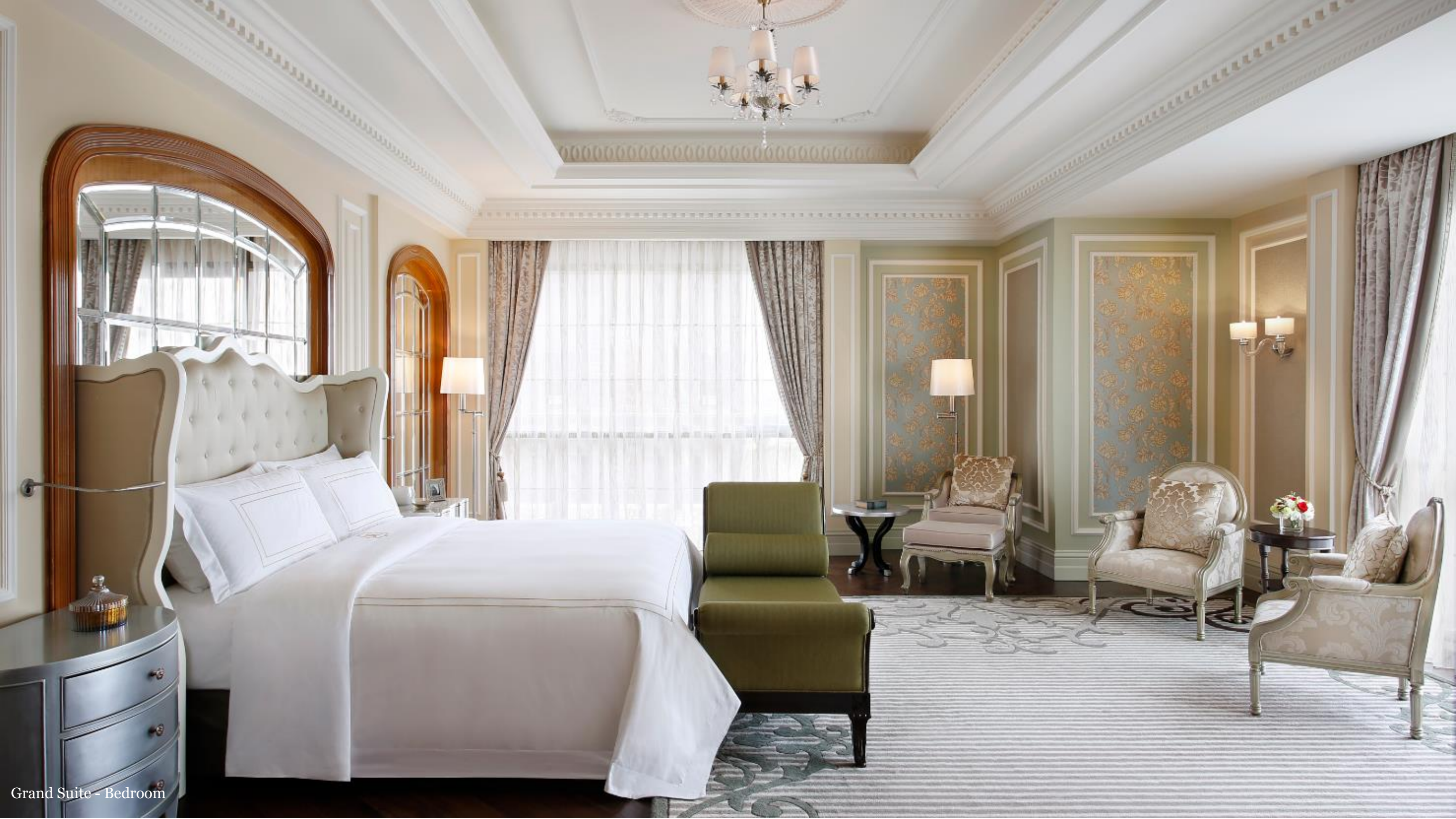
Grand Suite - Bedroom