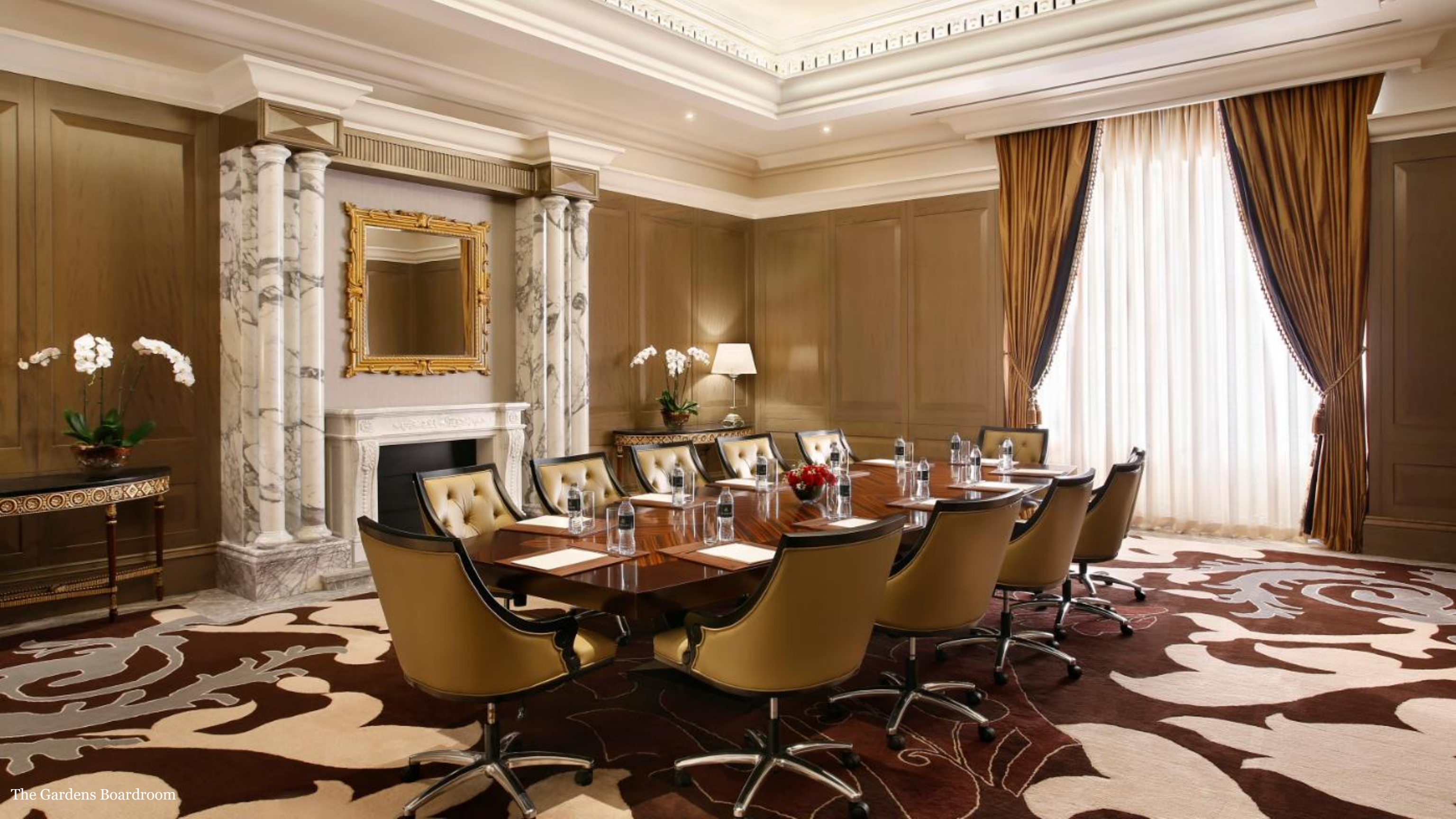
The Gardens Boardroom