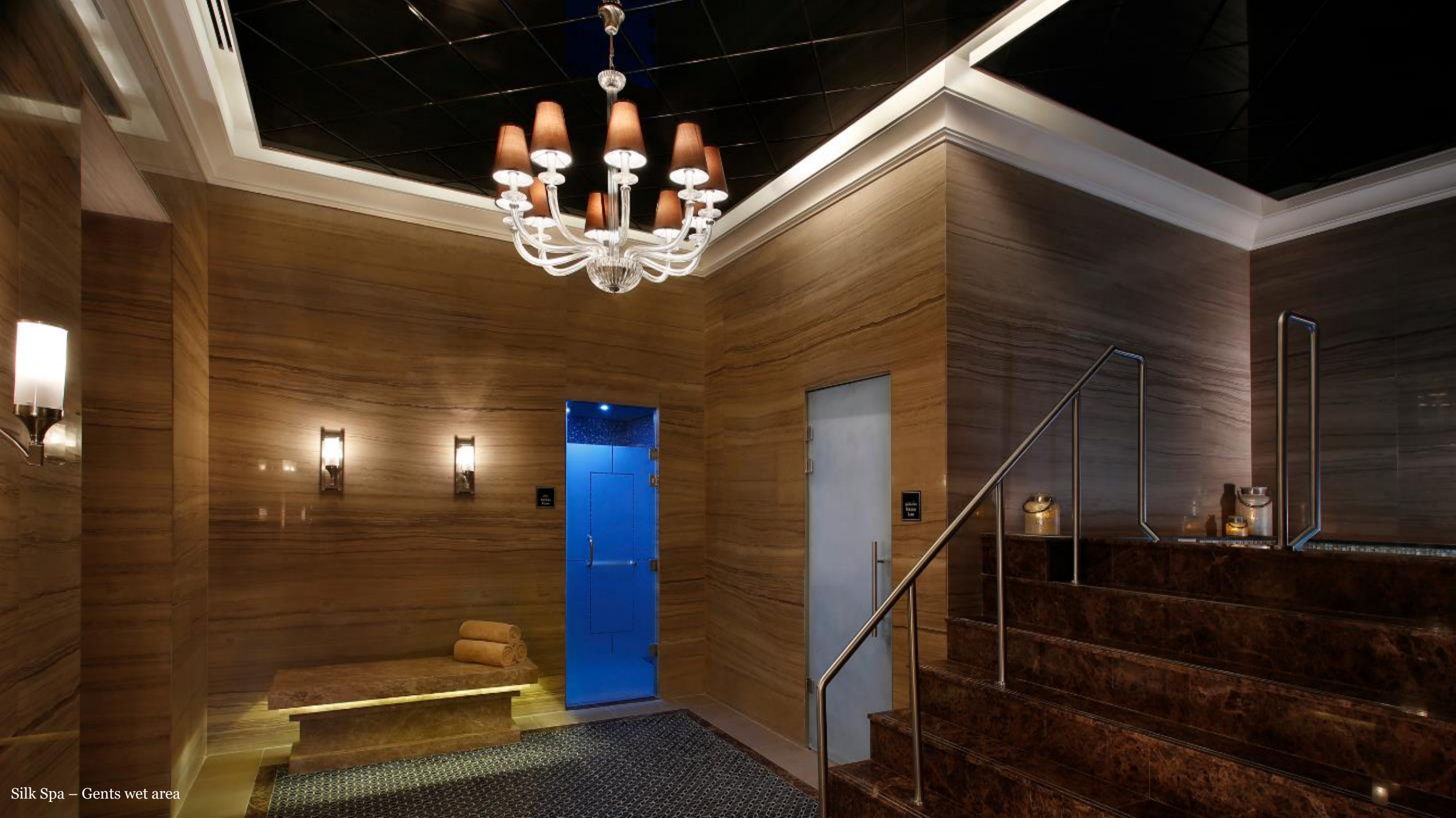
Silk Spa – Gents wet area